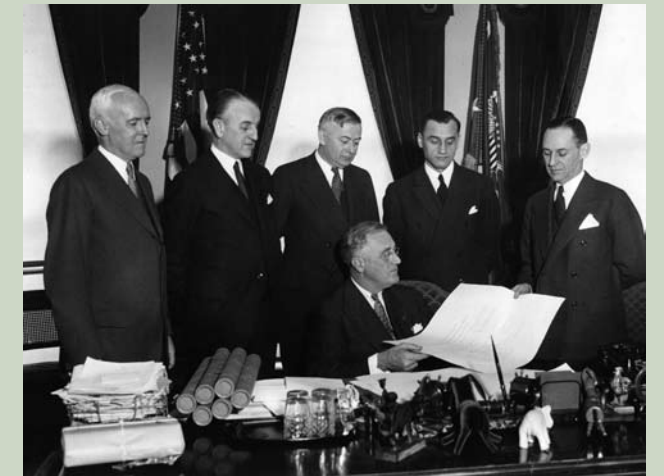
President Roosevelt signs the Banking Act of 1933

open market operations were becoming the main tool for carrying out monetary policy, overtaking another of the Fed's monetary policy tools: changes in the discount rate.