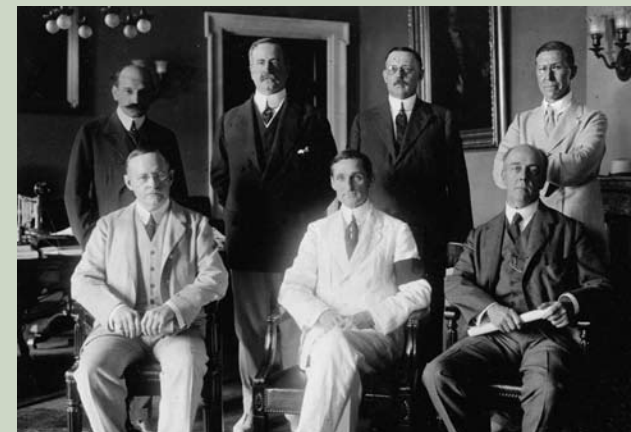
Federal Reserve Board members, 1914

The group was reorganized several times over the next few years, but this group involved only the Reserve Banks, not the Federal Reserve Board. Over time,